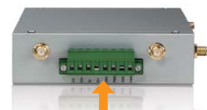
9~48Vdc Power Connector

Take power directly from vehicle battery